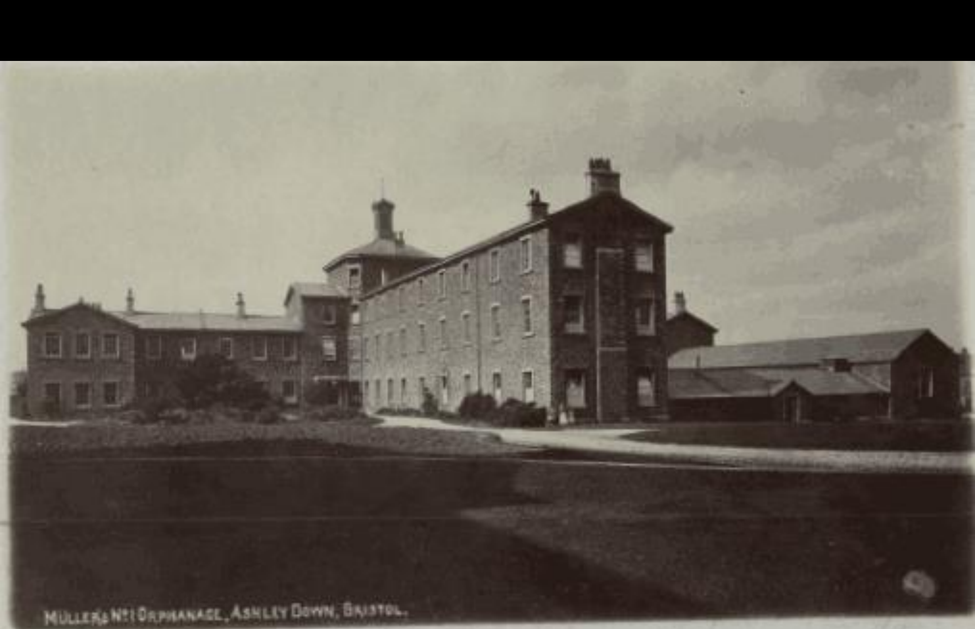
MULLER'S NRI ORPHANAGE, ASHLEY DOWN, BRISTOL.