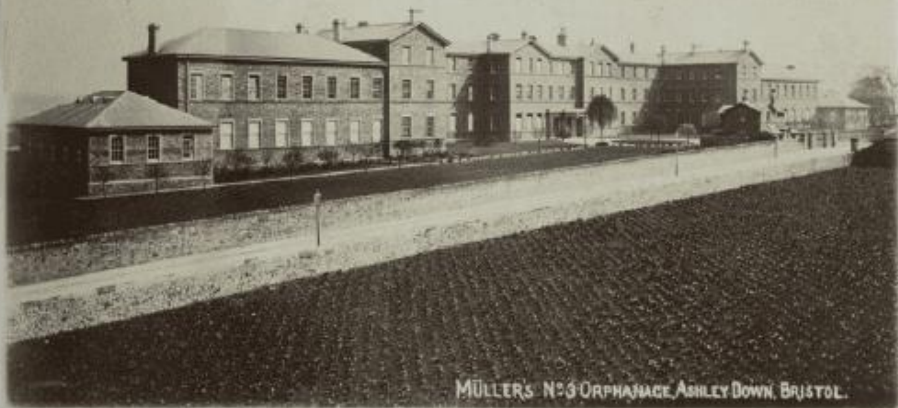
MÜLLER'S NO. 3 ORPHANAGE, ASHLEY DOWN, BRISTOL.