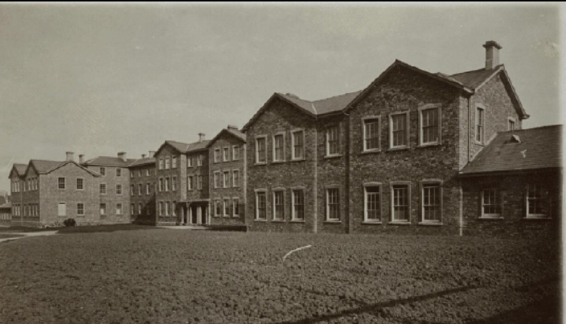
MÜLLER'S NO. 2 ORPHANAGE, ASHLEY DOWN, BRISTOL.